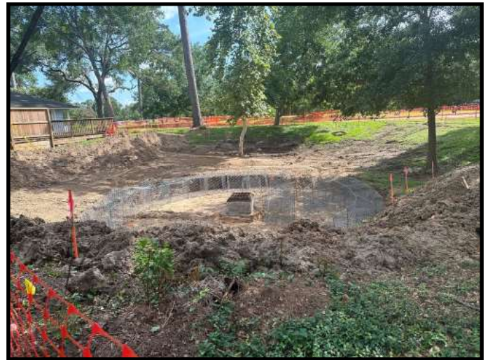
New Rain Garden Under Construction

and supports local ecology, making it a valuable addition to our neighborhood and a rare feature in Houston.