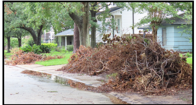
Tree debris piles are back - were they ever gone?!

Lastly, if you believe that you are a victim of price gouging related to these weather events (i.e., excessive prices for repairs, supplies, rentals, etc.), file a report at cao.harriscountytexas.gov .